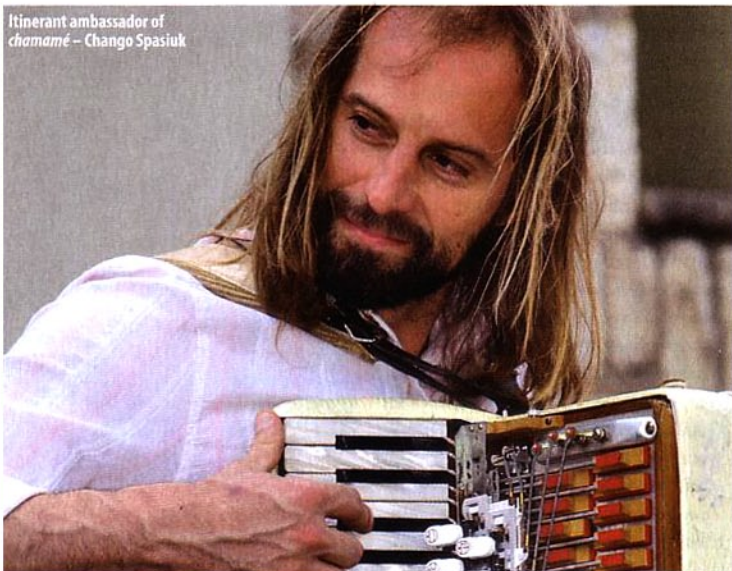
Itinerant ambassador of chamamé – Chango Spasiuk